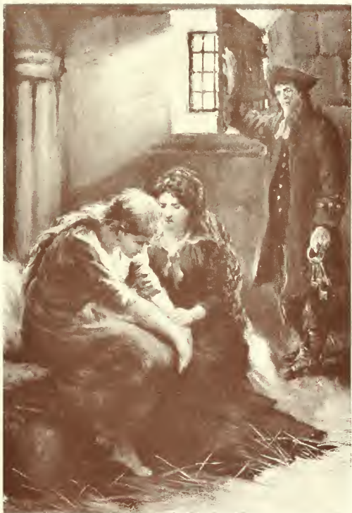
H.M. "The sisters sat down side by side."